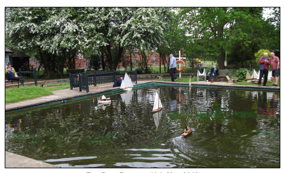
Toy Boat Regatta, 13th May 2018