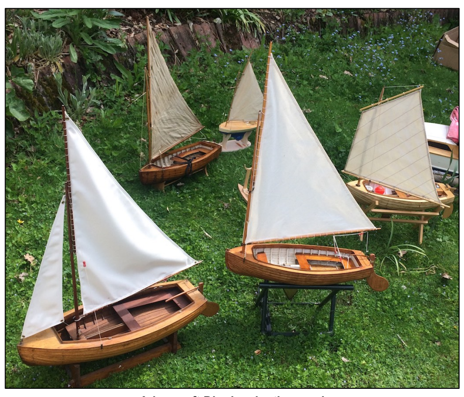
Adamcraft Dinghys by the pond