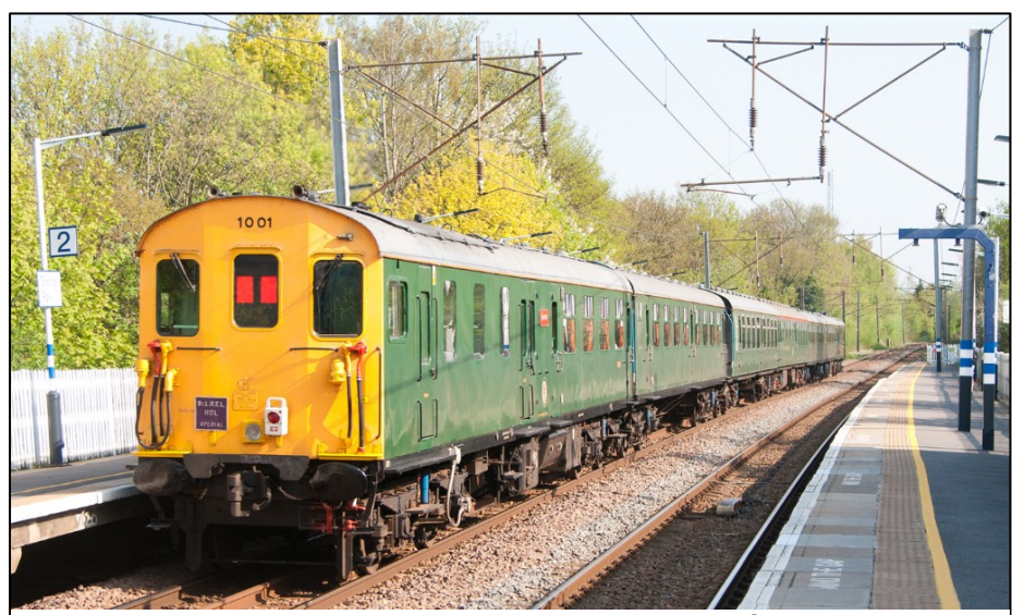
Hastings Unit 1001 on a Hastings-Kings Lynn charter, passes Grange Park. It was a full itinerary and must have been a long day for some.