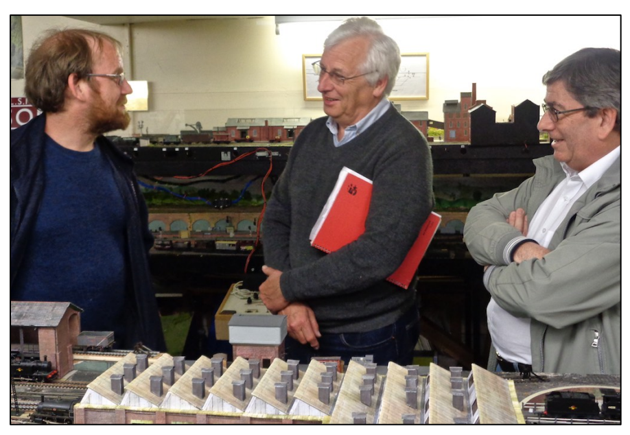
Our new Chairman chatting with the '00' lads

There being no further business to transact the meeting was drawn to a conclusion at three minutes shorter than the year before. The sections resident at HQ then threw their doors open to all members some of whom had not visited the building before. The modelling skills and enjoyment were easy to see at all sections.