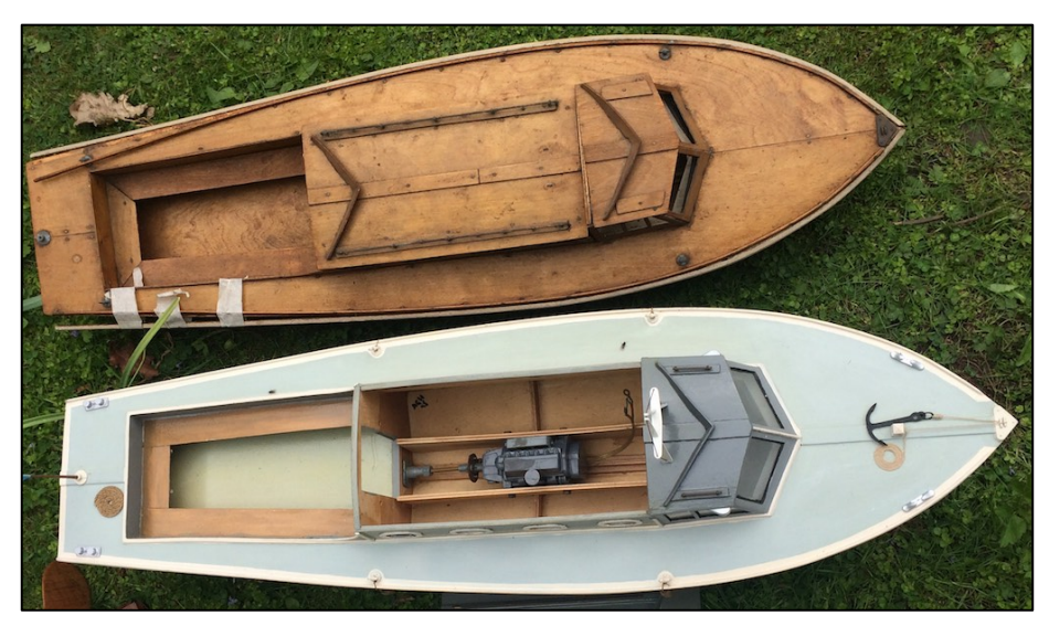
Adamcraft RAF Seaplane Tender